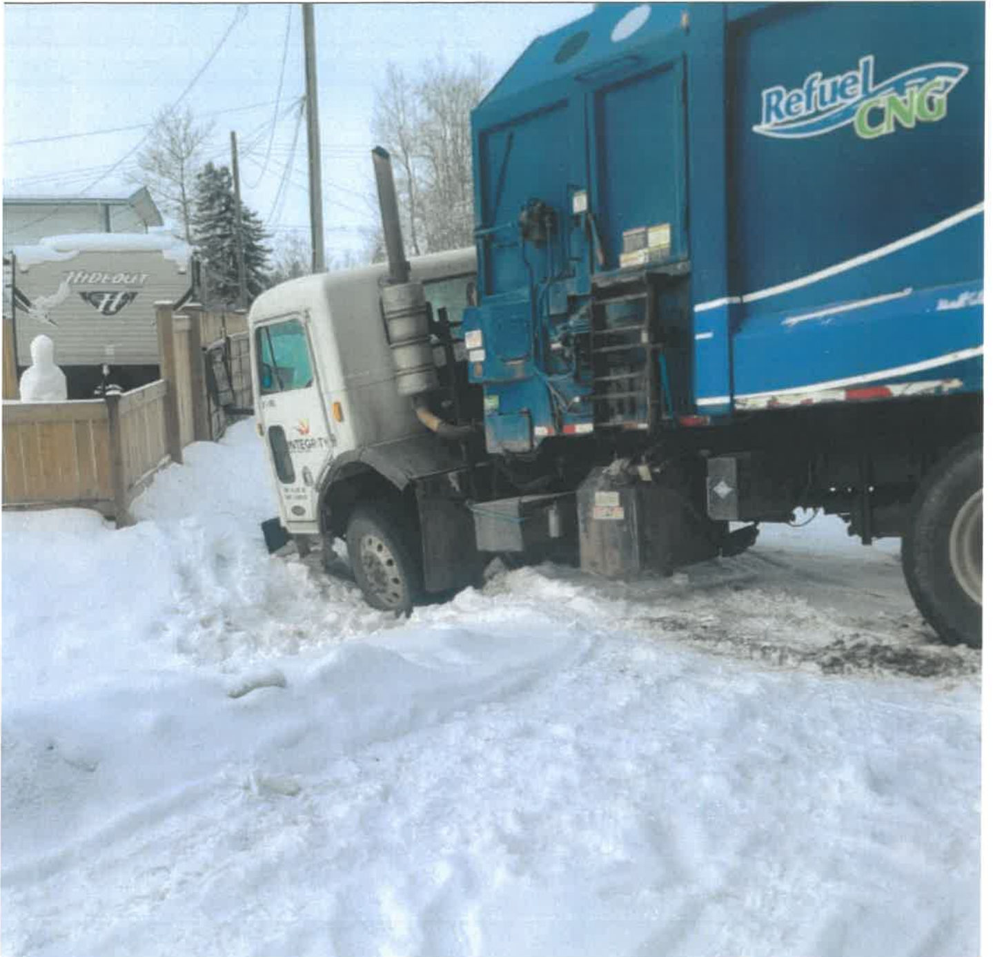
Alleyway to remain the same